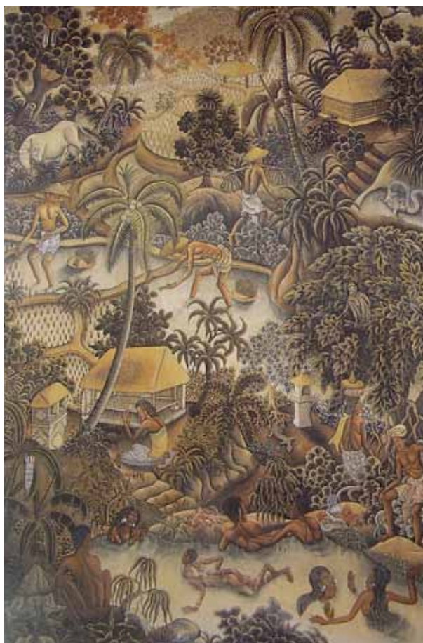
fig.3 (left) Anak Agung Gede Sobrat Life in Bali 1931 pen, ink and tempera on board 180 x 120 cm Collection of Museum Universitas Pelita Harapan, Lippo Karawaci, Indonesia

Equally, Balinese patterned landscape painting evolved from the 1930s from drawings and paintings of a mystical world of gods and goddesses, demons and spirits dramatically and energetically engaged in vertically defined space, reinforced by the reality of Bali's tropical environment, with the jungle flat against the viewer's eyes and glimpses of space and human activity interspersed through the lattice of vegetation. In Anuk Agung Gede Sobrat (1911–92)'s Life in Bali of 1931 (fig.3), the vegetation and figures at the top of the image are nearly the same size as those at the bottom. One of the first foreigners to make Balinese art known to the world, Mexican artist Miguel Covarrubias in his 1937 book Island of Bali , said about traditional painting: