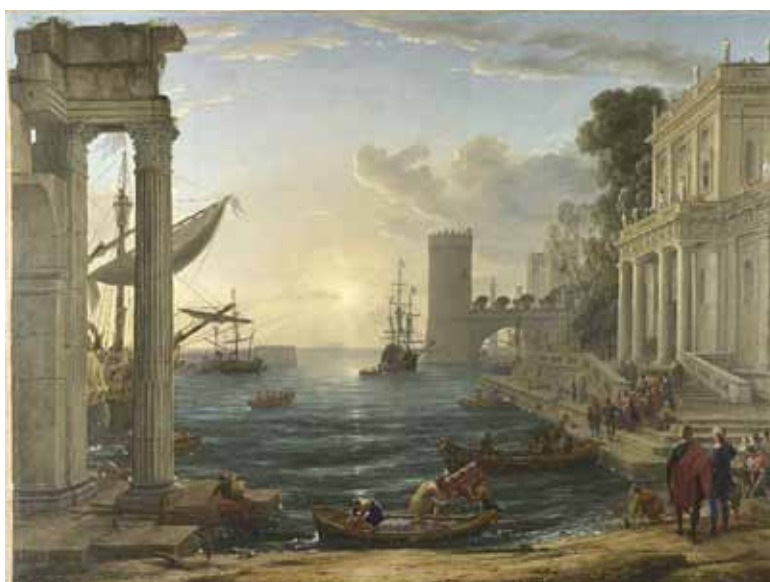
fig.1 Claude Lorrain Seaport with the Embarkation of the Queen of Sheba 1648, oil on canvas 149.1 x 196.7 cm

The desire to depict the place where people live seems universal, but the interpretation is based on the artistic tradition and context of each individual ... we do not see a bush or a tree or a piece of land in the same way at all.