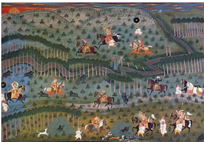
fig. 4 (below) Jugarsi Maharana Ari Singh II Hunting boar Udaipur 1762 opaque watercolour gold and silver paint on paper, 46.4 x 65.8 cm Collection National Gallery of Victoria, Felton Bequest 1980

Eighteenth century Rajasthani landscape paintings were intended to be seen laid flat on the floor viewed from all sides, so an illusion of 'distance' was of no interest or use. Special events are painted from this bird's eye view, so horses and carriages appear to 'rear' up around the sides of images presented vertically on current-day gallery walls or book reproductions. The relation of figures' sizes too is dependent on the position of the viewer, as well as the importance of the person painted. As the purpose of the painting was to marvel at the patron's vast estates, as much land as possible was included, and painted with precise and detailed line-work. The land is painted in piercing clarity, nail-hard trees spotted across it – just as it truly looks to the eye in the dry desert air of this north Indian state (fig.4).